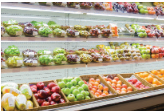
Misting in fruit & vegetable shelving