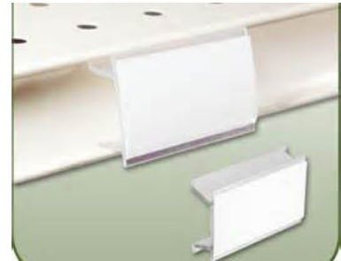
"C" channel shelf with channel clip